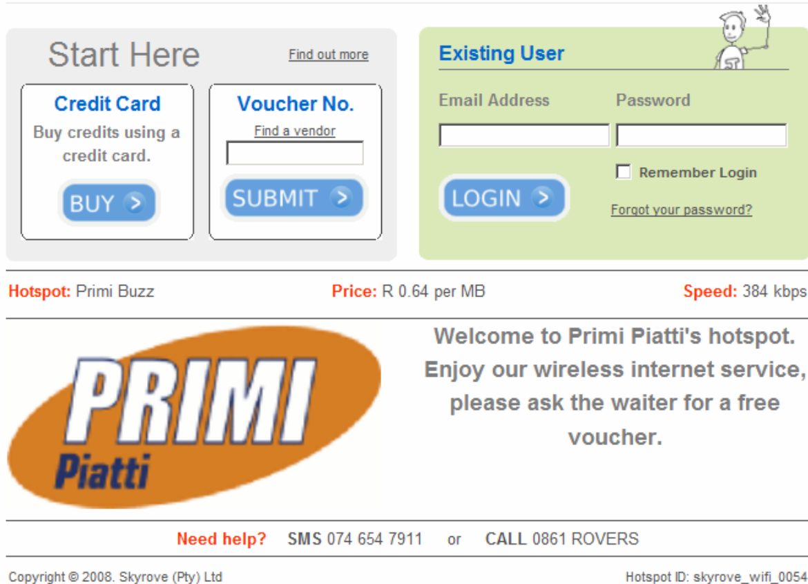
Figure 2 Skyrove Log-In Page